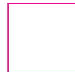
DIE LINE DO NOT PRINT

ADD 1/4" BLEED ALL AROUND MAXIMUM LABEL SIZE SHOWN P/S LABEL SUBSTRATE ( 6 PT. MINIMUM) NO CRACK & PEEL BACKING SCALE - FULL SIZE